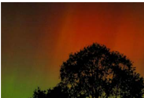
Aurora Over Chalfont.