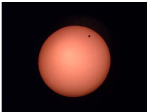
Transit of Venus.